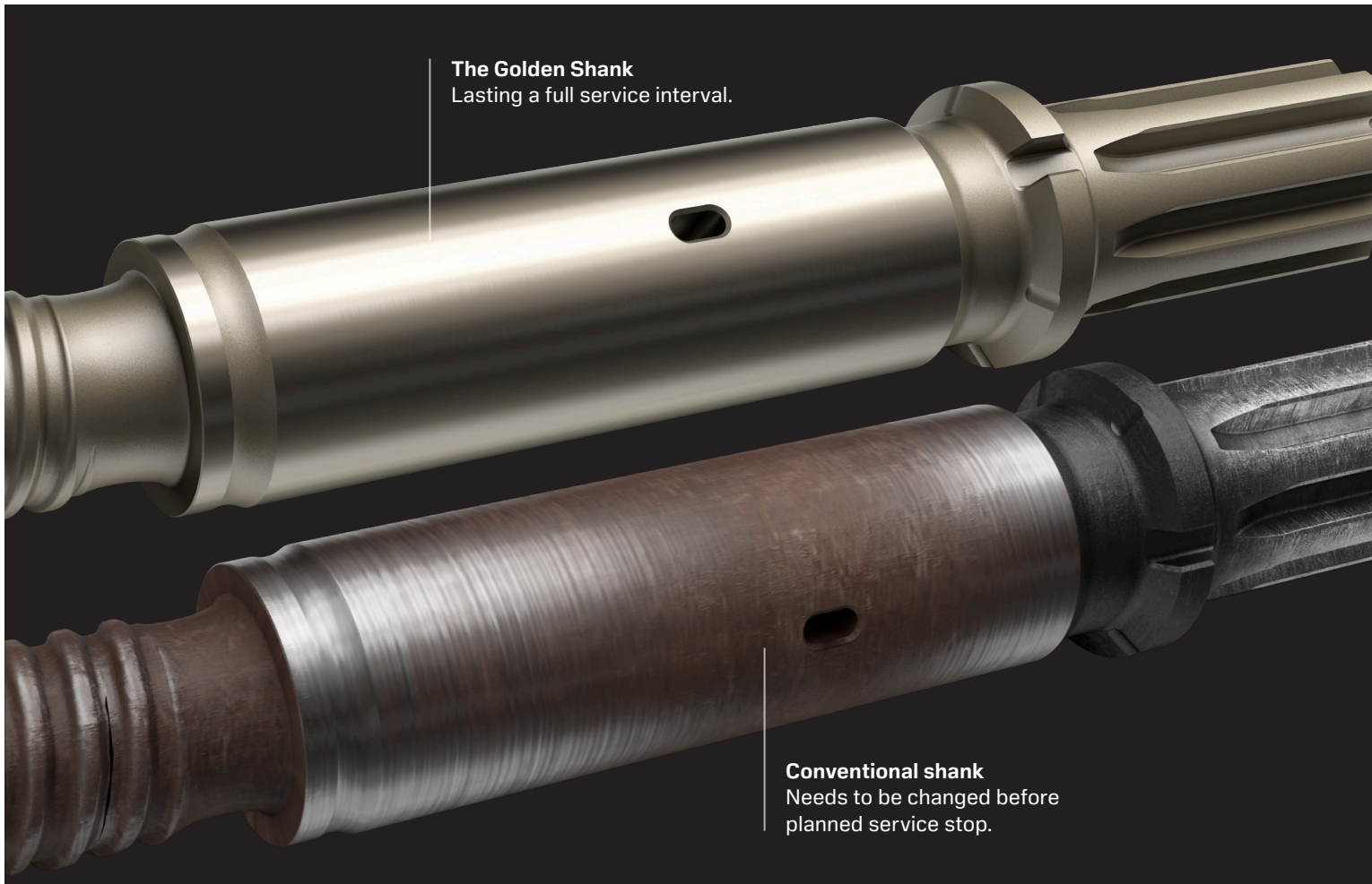
The Golden Shank Lasting a full service interval.