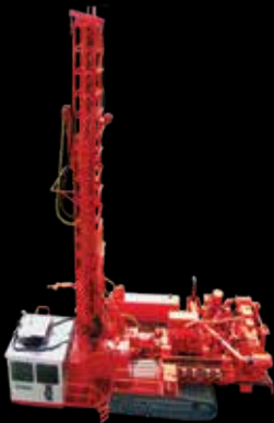
PEDESTAL SURFACE DRILLS

Sandvik Rebuilds offers mining and construction companies a way to maintain their machines' reliability and productivity over their full engineered lifecycles. That is the key reason to identify the Optimum Interval for a major intervention. Sandvik Parts and Services work closely with our customers to proactively identify the right moment for an intervention, and to find the right solution and scope according to their needs, goals and circumstances.