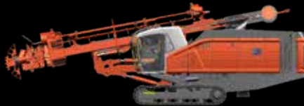
BOOM SURFACE DRILLS