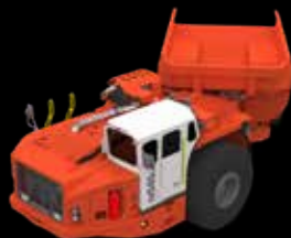
LOADERS & TRUCKS (MASS MINING)