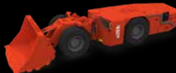
LOADERS & TRUCKS (NARROW VEIN/LOW PROFILE)